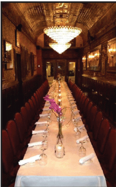
SIDE DINING ROOM

* PLEASE LET US KNOW IF ANY OF YOUR GUESTS HAVE CERTAIN DIETARY RESTRICTIONS OR ALLERGIES